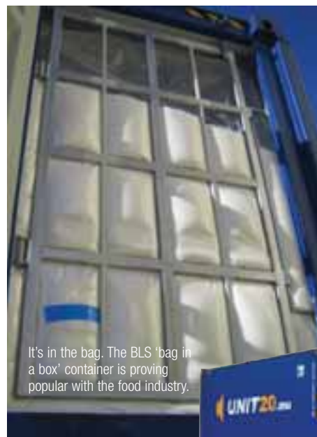
It's in the bag. The BLS 'bag in a box' container is proving popular with the food industry.

Quality Freight Group company Bulk Logistic Solutions has launched a specialist "bag in the box" service.